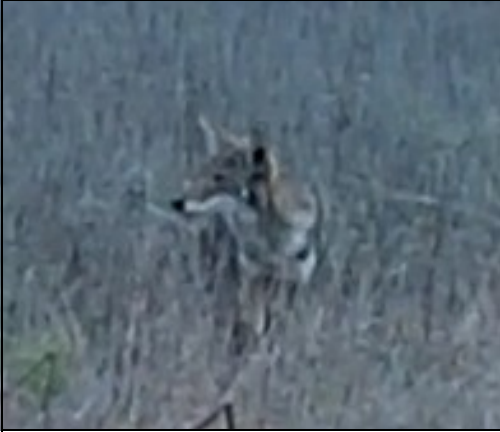
California Grey Fox

On Thanksgiving morning I took a short hike up to Stanley Peak. There is a proposal before the City Council to build 100 homes just to the Northwest, and I wanted to get the lay of the land. Around 1990 the Council at that time approved a road easement on Daley Ranch to access this type of development. This road easement would be constructed as a full service City street. Curbs, gutters, storm drains. While walking on the current trail, which will become the street, I came across a California Gray Fox. You can see the three minute video at http://www.youtube.com/watch?v=ExyHzKt4k6w